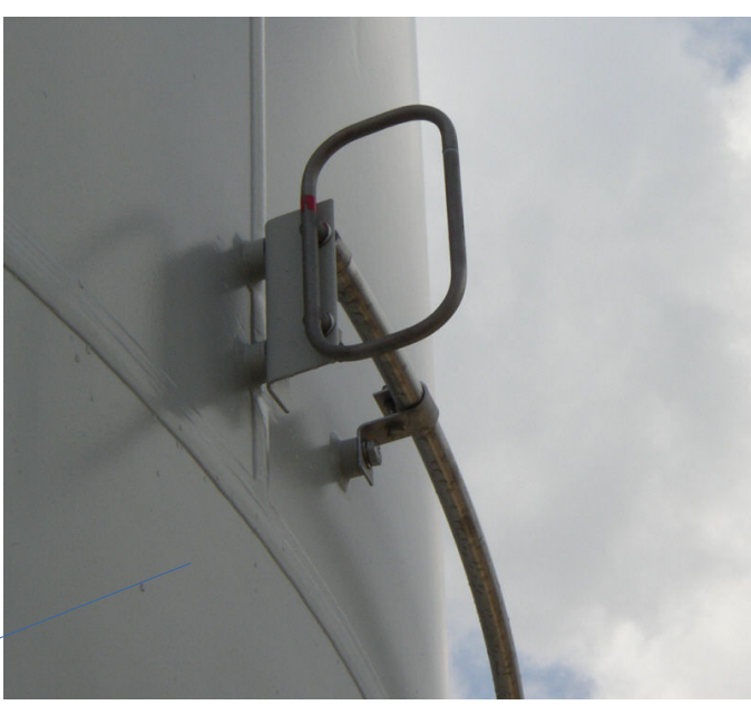
Antennas at bottom of tower