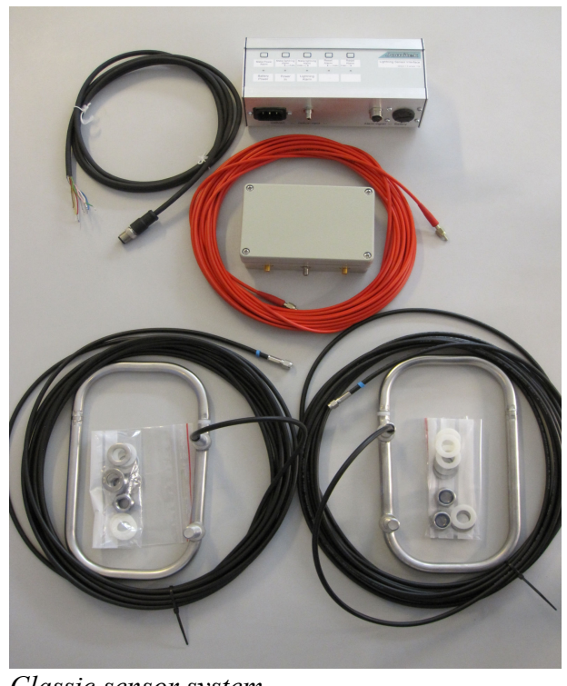
Classic sensor system

The antennas send the lightning generated signal to the inside antenna box. This box converts the antenna signals to an optical signal that is received by the control box. The control box gives the alarm to the turbine control. The turbine control resets the alarm signal